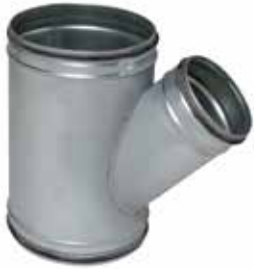
Angled T-piece with seal

The 45° branch piece with seal is used to connected two galvanised ducts at a 45° angle while delivering class C airtight performance.